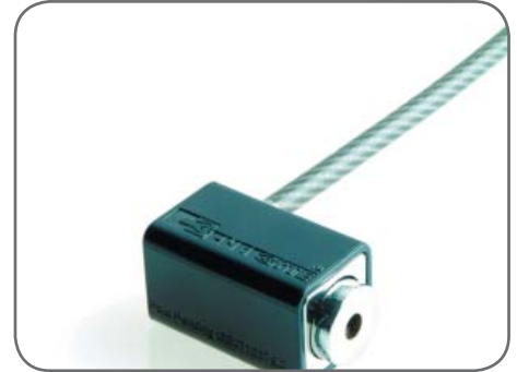
CubeByte Laptop Lock