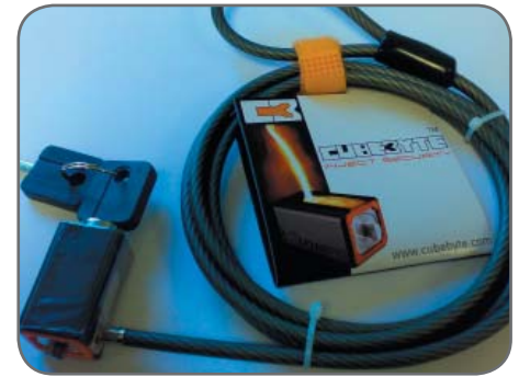
With 2 keys, cable, and security loop