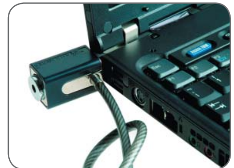
Lock into machine

Hypertec's sales and product management team is always available to give you advice on physical security, simply contact us as below.