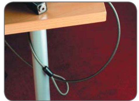
Loop around secure fixing point