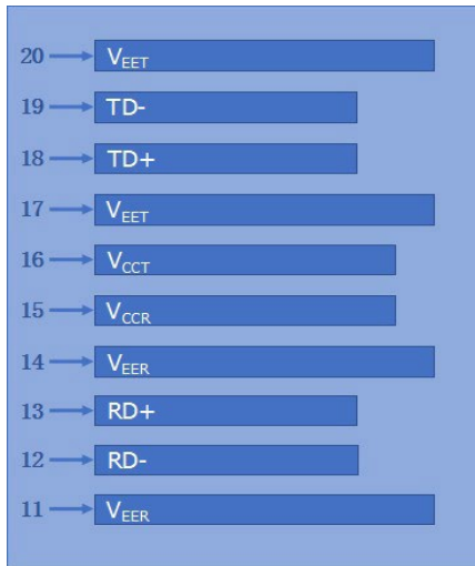
Top of Board