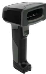
Image COMS Scanning

Work with Windows, Mac OS, Android and Linux