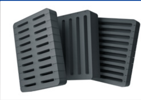
Flexible integration with custom foam tailored to specific devices