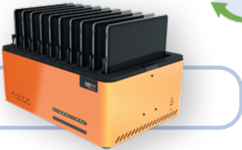
Version for 10 tablets