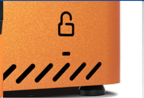
Notch for securing with a safety cable