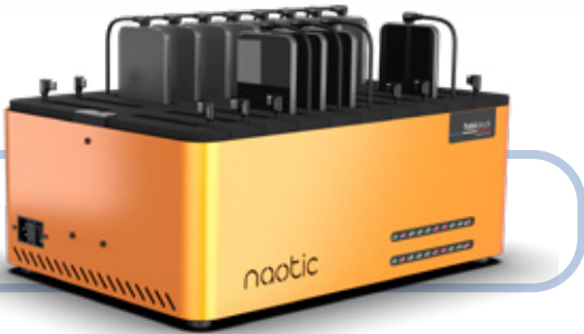
Version for 20 smartphones

Recharge your devices yourself, close to where you use them