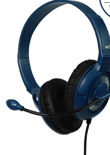
TRRS ITEM#: 2AE5-5BL