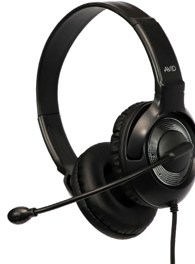
TRRS ITEM#: 2AE5-5KL USB ITEM#: 2AE5-5USBKL