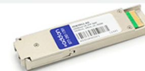
▶ OEM Matched Transceivers