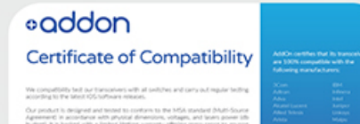
▶ Addon® Compatibility