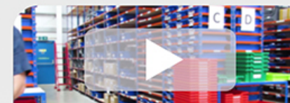
▶ AddOn UK Facility Tour