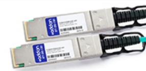
▶ OEM Matched DAC/ AOC